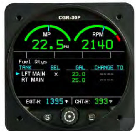
Fuel Qtys Screen