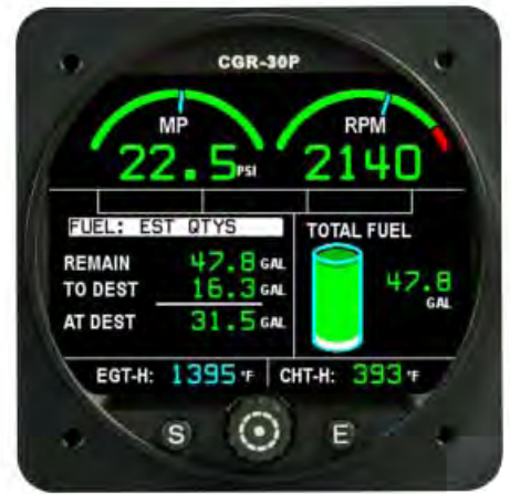
Fuel Data Screen

User Setup Screens (see section 6.0): The User Setup Screen Menu provides a list of setup screens for setting the K-Factor, setting clocks, viewing the Tach and Engine Hours, setting the display range for the bar graph, downloading recorded data and setting up the Recurring Fuel Alarm.